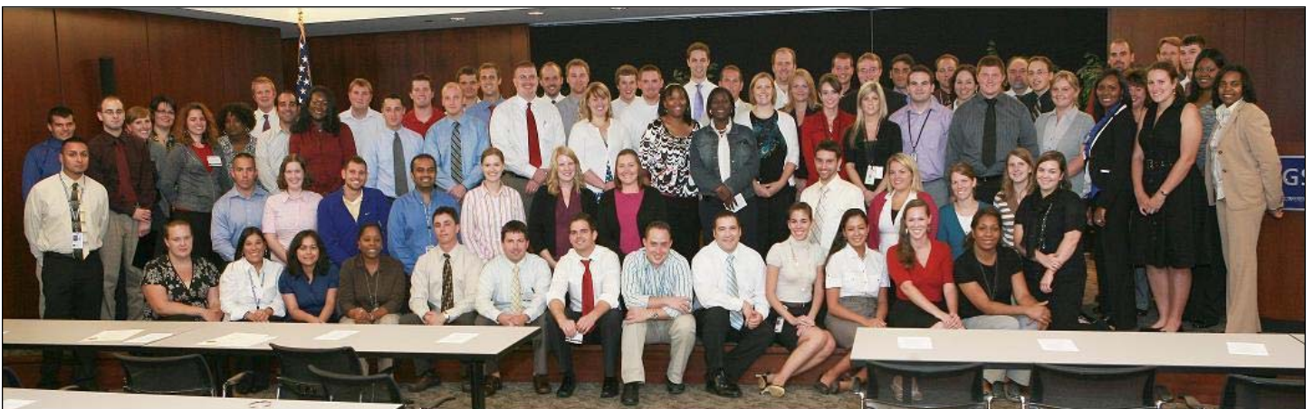
PBS Great Lakes Region trainees commemorate the conclusion of a fun and enriching 2009 Trainee Forum.