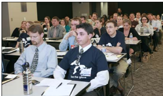
Above: A full house for one of the Trainee Forum's many informative training seminars.